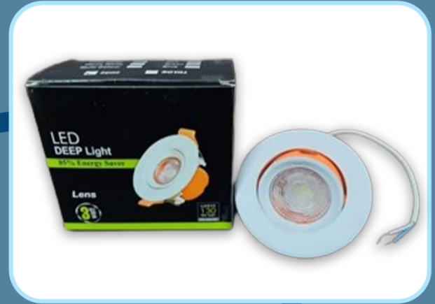
KR Deep Light 3w