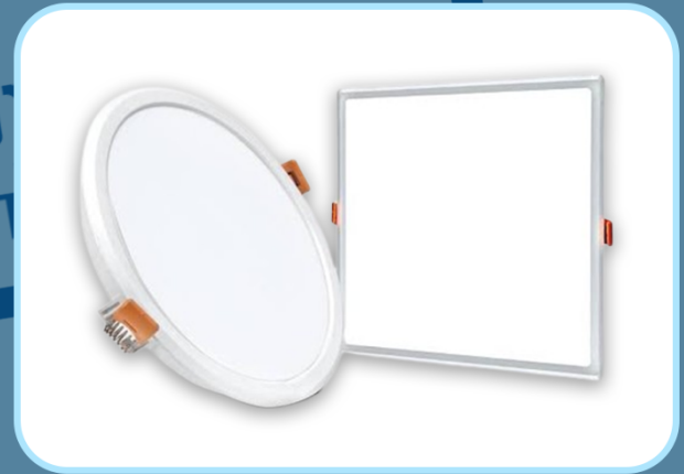
KR Panel (Slim) Light 20w

KR (SINCE 2020) INDUSTRIES (P) ISO 9001-2015 CERT