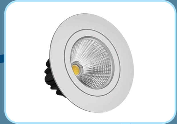
KR Movable Cob Light (5w 9w 12w 20w 30w 50w)