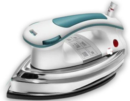
KR Iron Model -2

KR (SINCE 2020) INDUSTRIES (P ISO 9001-2015 CER