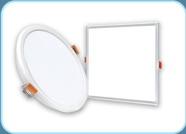
KR Panel (Slim) Light 8w