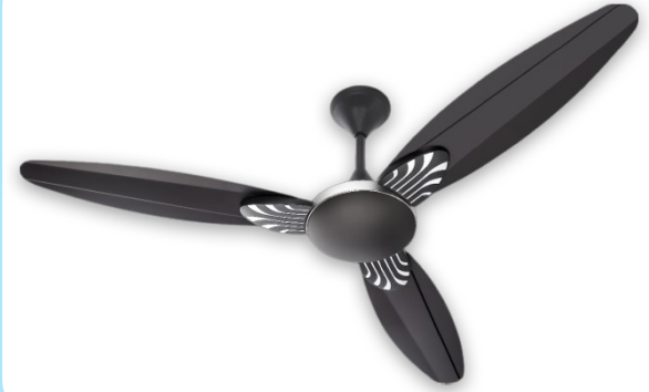
KR Ceiling Fan Model-1