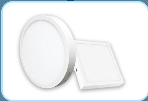
KR Panel (Surface) Light 15w