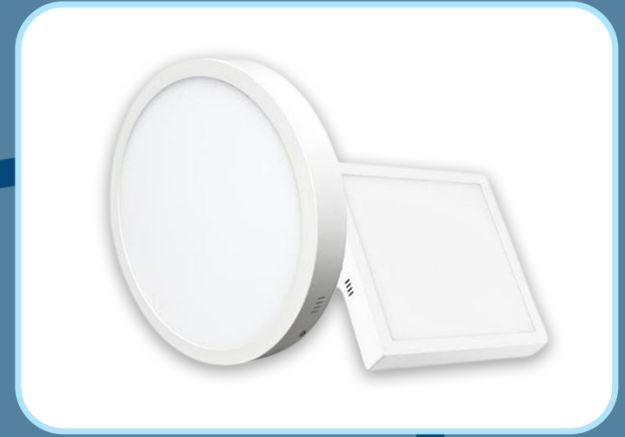
KR Panel (Surface) Light 8w