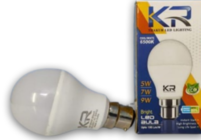
KR Led Bulb 12w