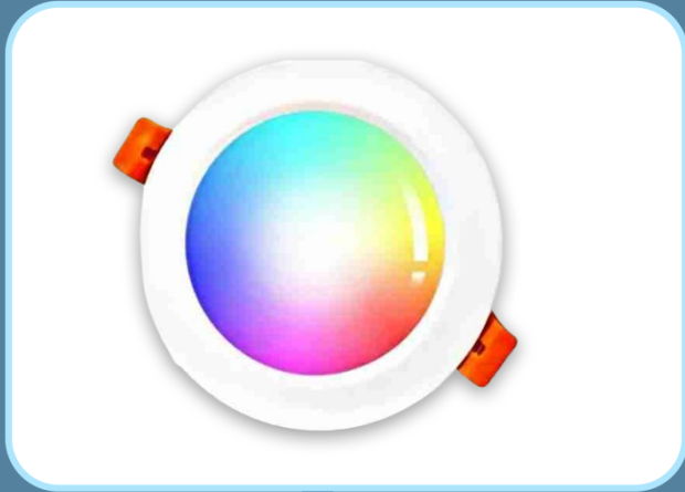
KR Concealed Colour Light