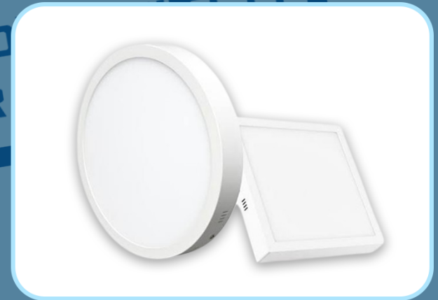
KR Panel (Surface) Light 20w

KR (SINCE 2020) INDUSTRIES (P) ISO 9001-2015 CER