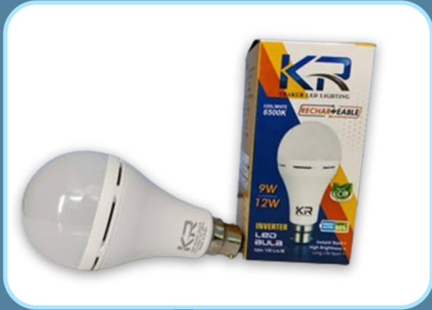
KR Led Bulb (ac dc) 9w 12w