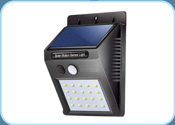
KR Solar Light Outdoor 20w