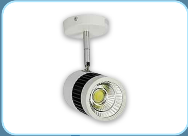
KR Cob Wall Light 30w