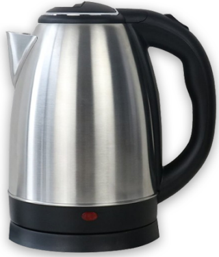
KR Electric Steel Kettle