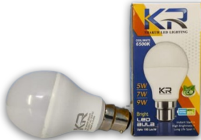
KR Led Bulb 9w