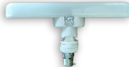
KR Led T-Bulb 10w

KR (SINCE 2020) RT INDUSTRIES (P) LIMITED AN ISO 9001-2015 CERT