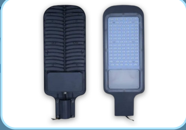
KR Street Light (20w 30w 50w 100w 200w)