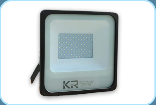
KR Flood Light (30w 50w 100w 200w)