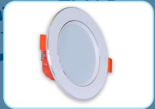
KR Concealed Light 12w