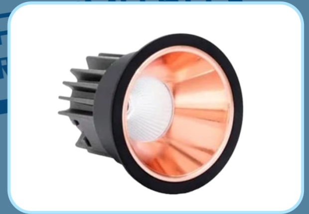
KR Golden Cob Light 12w