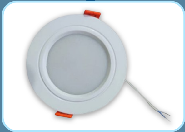
KR Concealed 6w