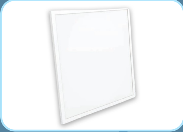
KR Panel Light 36w